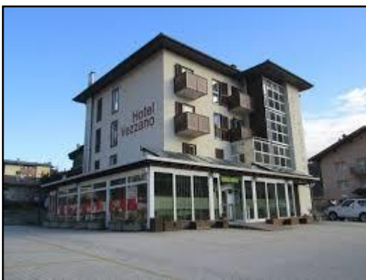
Hotel Vezzano Indirizzo: Via Roma, 156, 38070 Vezzano TN Telefono: +39 0461 864062