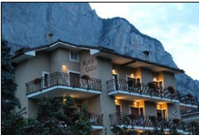
Hotel Daino Indirizzo: Viale Daino, 17, 38070 Pietramurata TN Telefono: +39 0464 507131