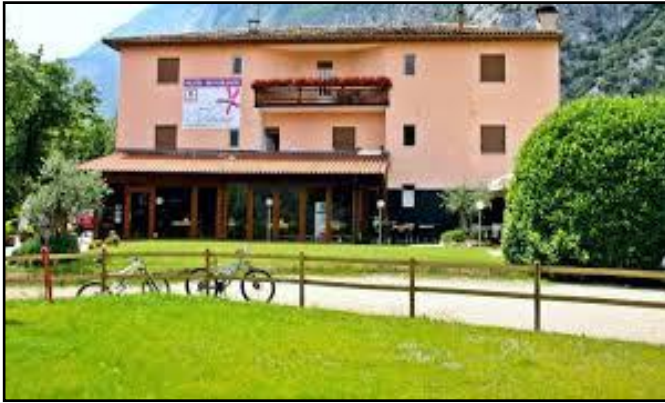
Hotel Ciclamino Indirizzo: Via Cargadori, 1, 38070 Pietramurata TN Telefono: +39 0464 507140