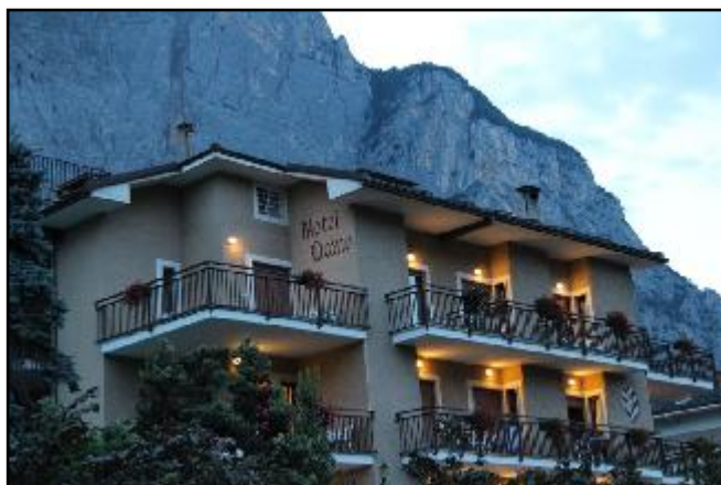
Hotel Daino Indirizzo: Viale Daino, 17, 38070 Pietramurata TN Telefono: +39 0464 507131