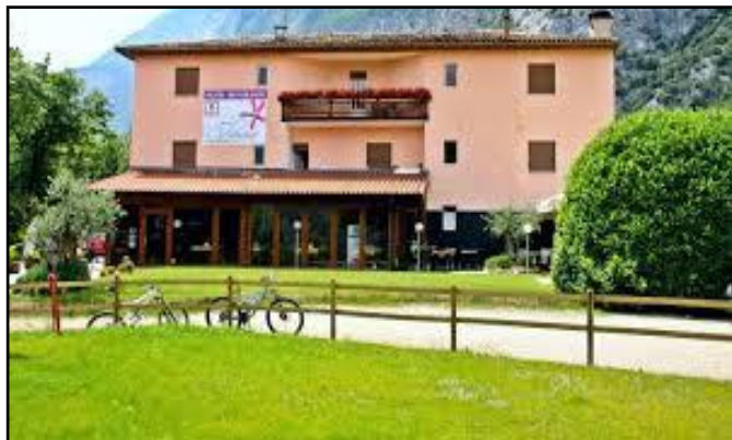
Hotel Ciclamino Indirizzo: Via Cargadori, 1, 38070 Pietramurata TN Telefono: +39 0464 507140