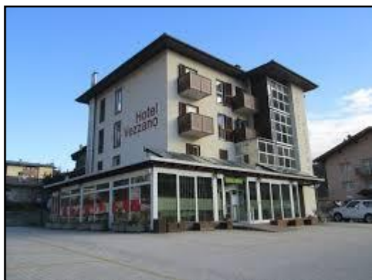
Hotel Vezzano Indirizzo: Via Roma, 156, 38070 Vezzano TN Telefono: +39 0461 864062